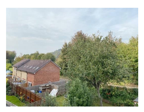
72 Homeminster House, Station Road, Warminster, Wiltshire, BA12 9BP